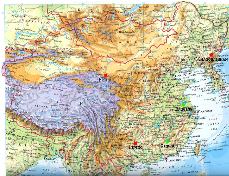
Fig. 2. Locations of project core sites (Liping County, Heihe River Basin and Changbaishan Biological Reserve) and auxiliary sites (Xinguo County and Baoying County).

forests. Many international research projects have been conducted here resulting in a variety of accumulated data sets for its ecosystems. Extensive IA work was also previously done by CAREERI.