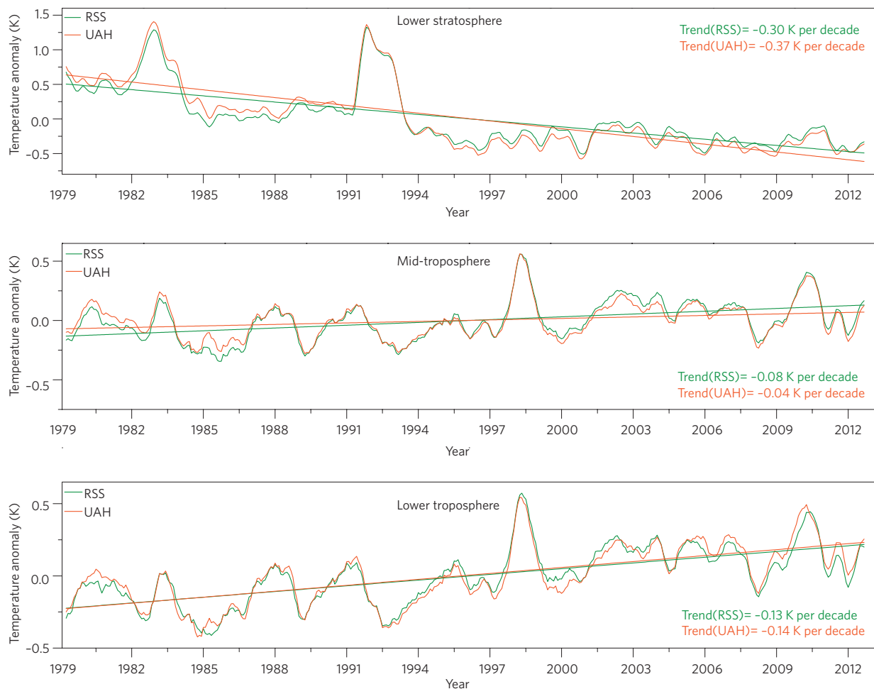
Figure 2 | Upper atmosphere temperature trends between 1979 and 2012 based on MSU data sets. Data from the University of Alabama at Huntsville (UAH) and the Remote Sensing Systems (RSS) are shown here. A 6-month moving window smoothing has been applied to the data sets. Both data sets now show a warming trend, whereas UAH formerly reported a cooling trend in the lower troposphere 23 . Data from the National Climate Data Center; http://vlb.ncdc.noaa.gov/temp-and-precip/msu .

1979 to 2010 32 . Researchers hypothesize that this slight increase was caused by reduced upward heat-transport in the oceans and increased snowfall 33 . The situation is reversed in the Arctic, where satellite observations show an overall negative trend of -4.1 \pm 0.3\% per decade in that period, with the largest negative trend occurring in summer 34 . This concurs with climate model projections, but its magnitude is larger 35 . Whether the Arctic as a whole has reached a ‘tipping point’ (a point in time when the decrease of ice in the Arctic cannot be reversed) is still a matter of debate, but some researchers believe that satellite observations show that a ‘regional tipping point’ has been reached, given that the average age of multi-year ice is decreasing, and the percentage of oldest ice declined from 50% of the multi-year ice pack to 10% from 1980 to 2011 36 .