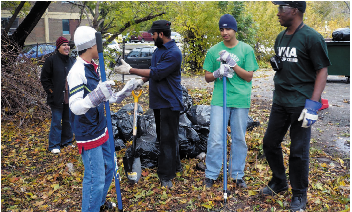
Residents in Scarborough Village clean up a local walkway