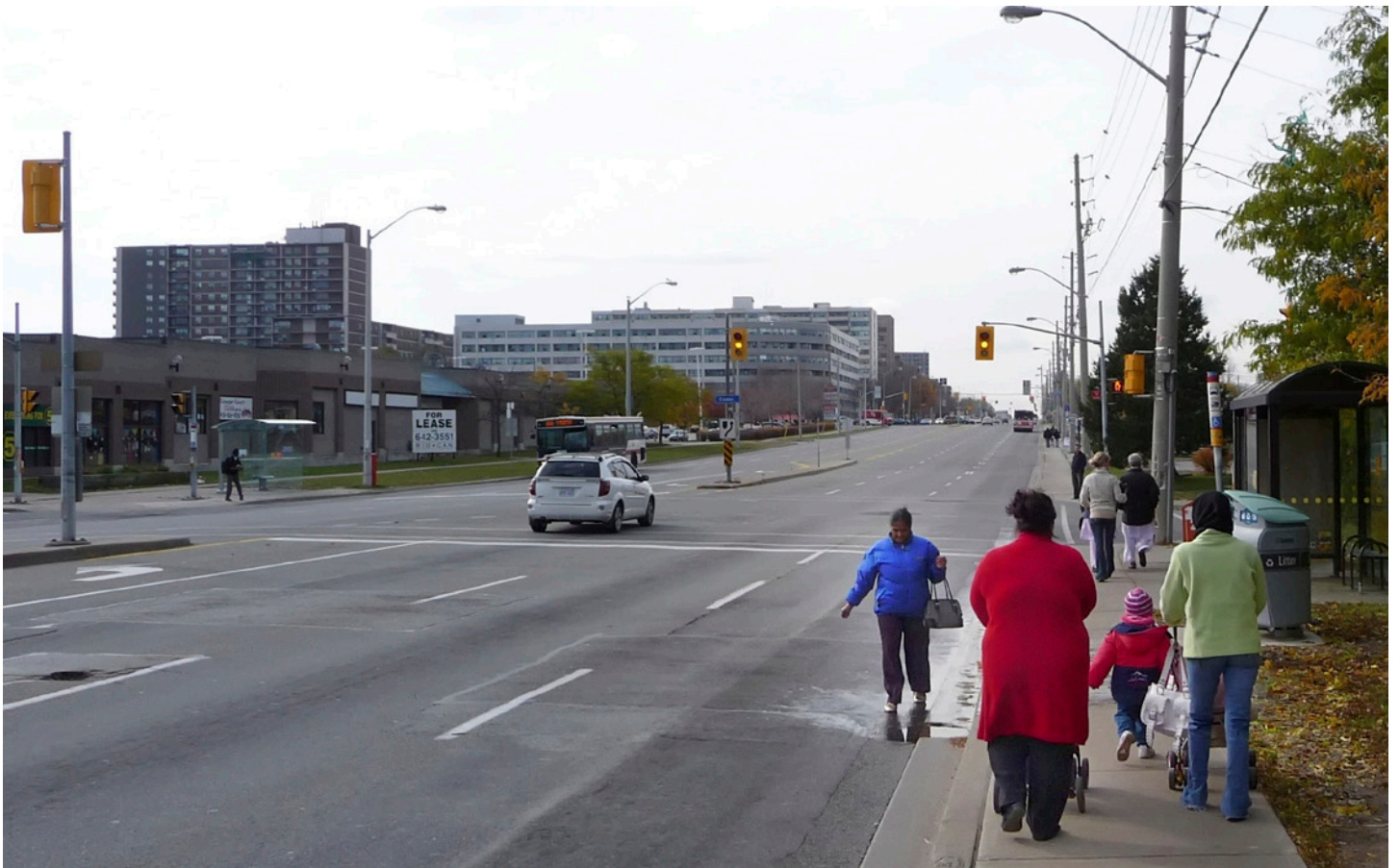
A busy, narrow sidewalk in Scarborough Village