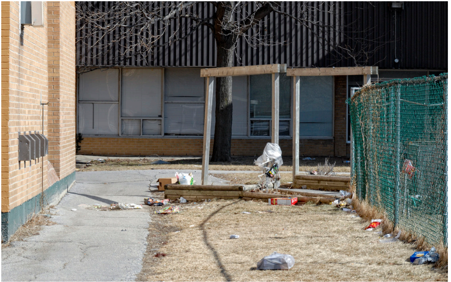
Path from Sheridan Mall to high-rise tower in Chalkfarm