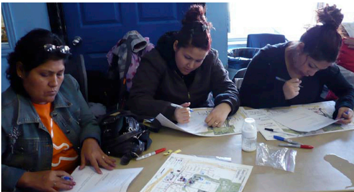
Walkability workshop participants in Chalkfarm

http://faculty.geog.utoronto.ca/Hess/hess_home.html www.janeswalk.net/walkability www.citiescentre.utoronto.ca