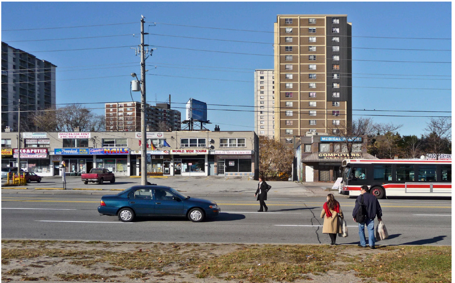
Pedestrians cross Eglinton Avenue mid-block in Scarborough Village