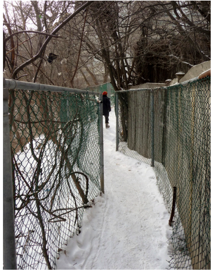
A narrow walkway in Thorncliffe Park