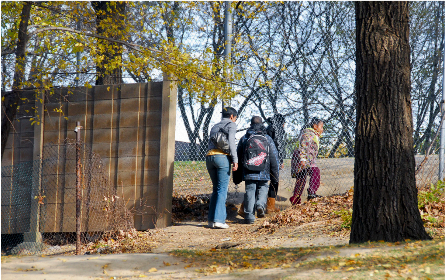
The hole in the Goodview path fence in The Peanut