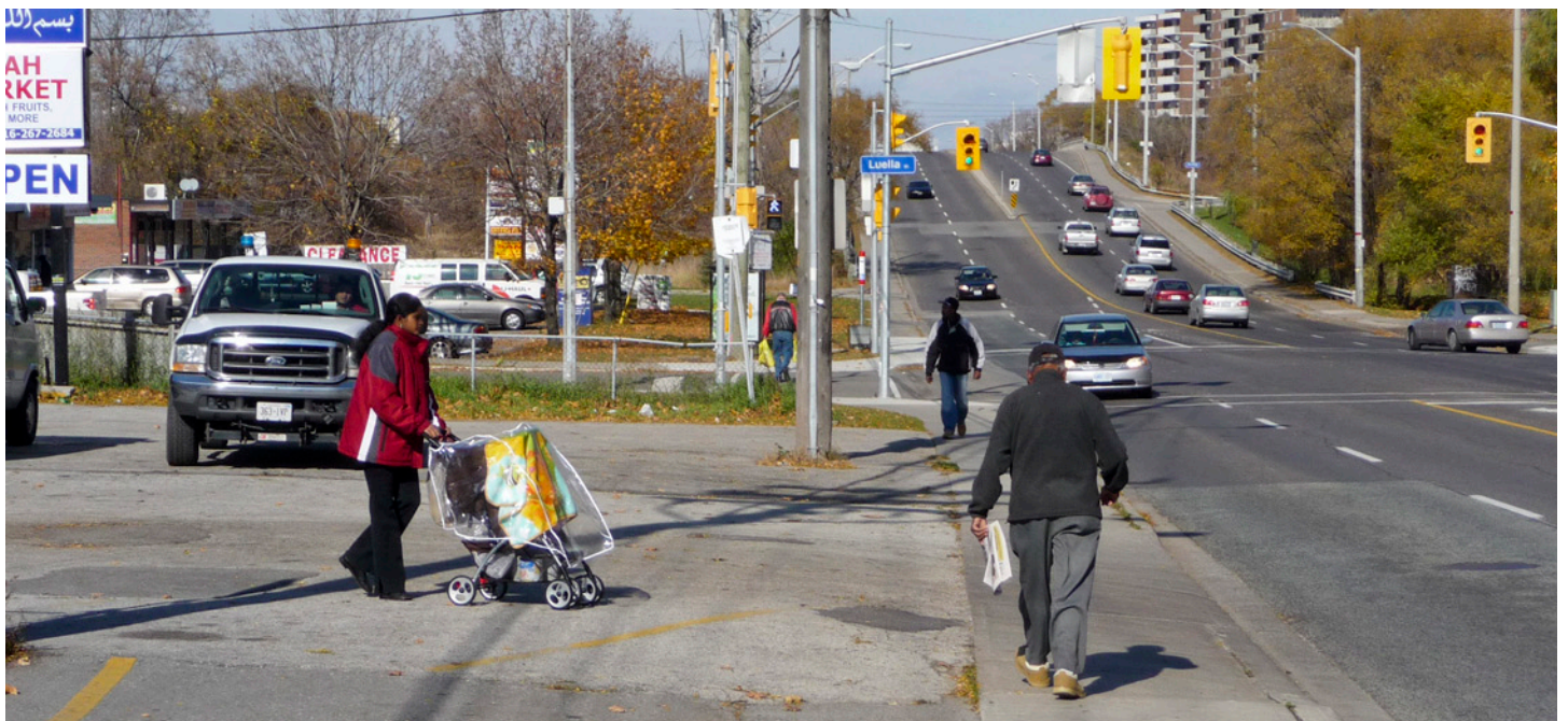
Pedestrians exposed to traffic on Markham Road in Scarborough Village

Men were less likely than women to adapt their behaviour over security concerns. In survey results, 56% of women and 73% of people 65 years and older reported avoiding walking at night due to security concerns. Both groups kept to well-lit areas if they needed to walk at night.