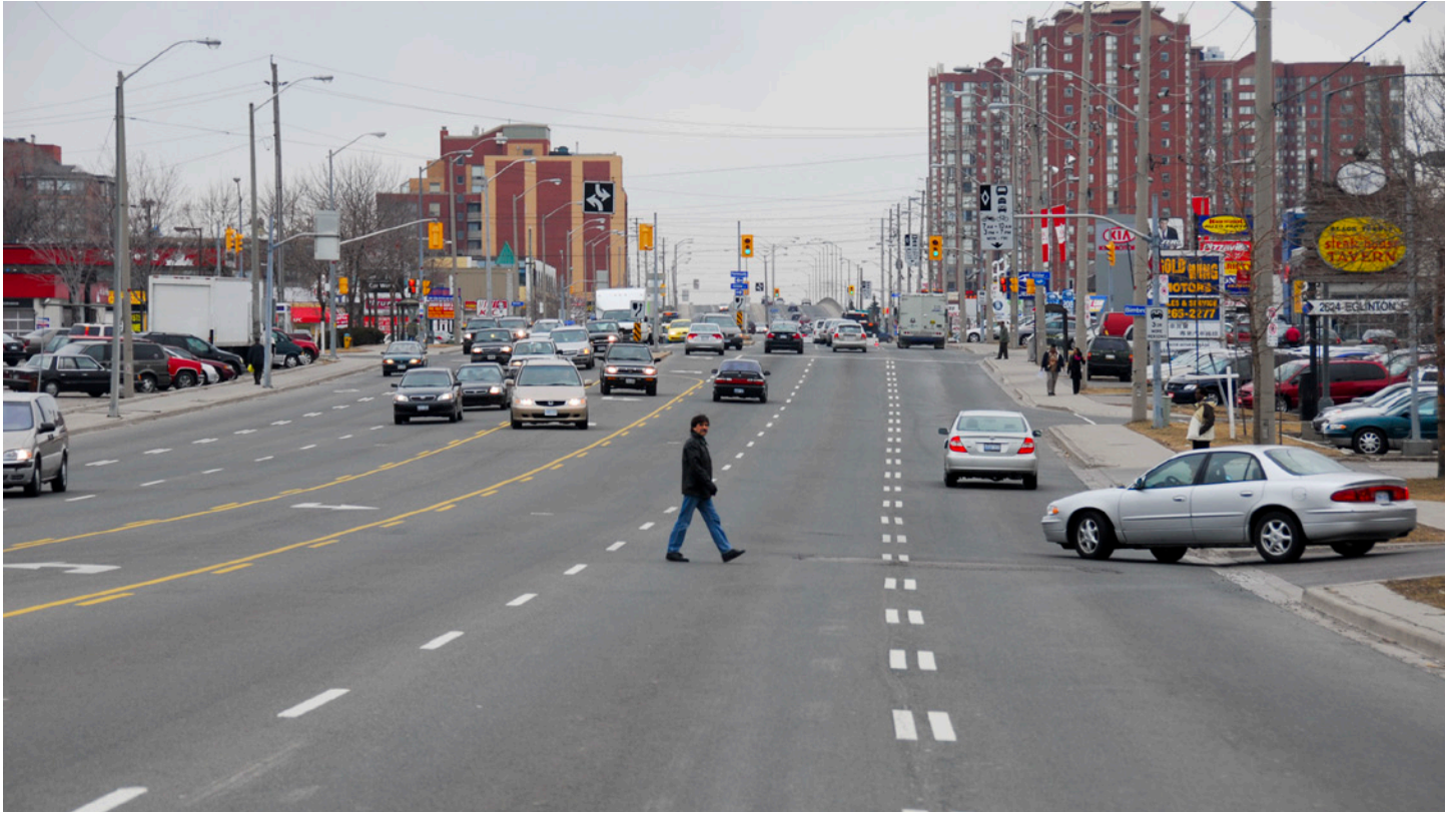
Mid-block crossing on Eglinton East

These images of high-rise neighbourhood walking conditions provide a representative sample of our study area documentation. They are available for publication with the consent of Katherine Childs (khchilds@gmail.com).