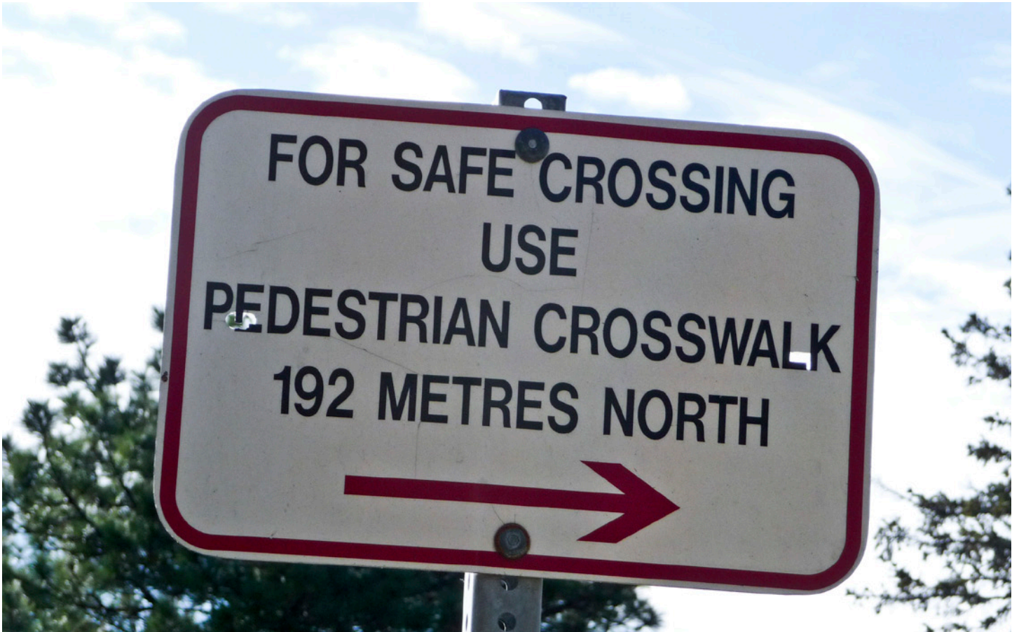
Sign in The Peanut