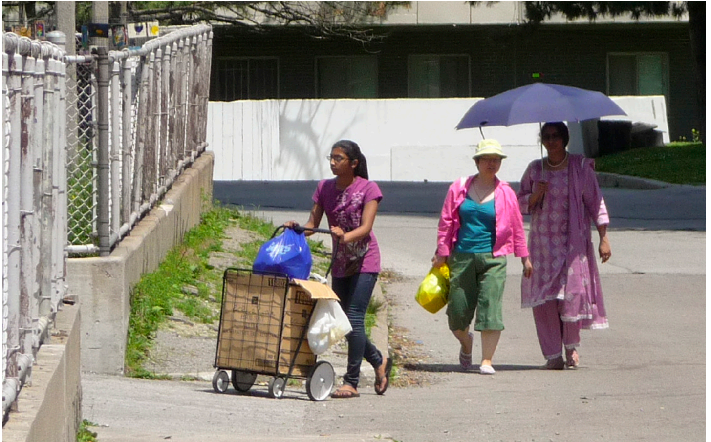
Pedestrians in a St James Town driveway