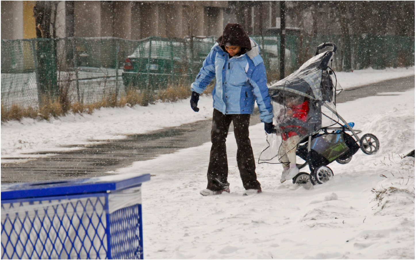
Difficult winter conditions in Thorncliffe Park