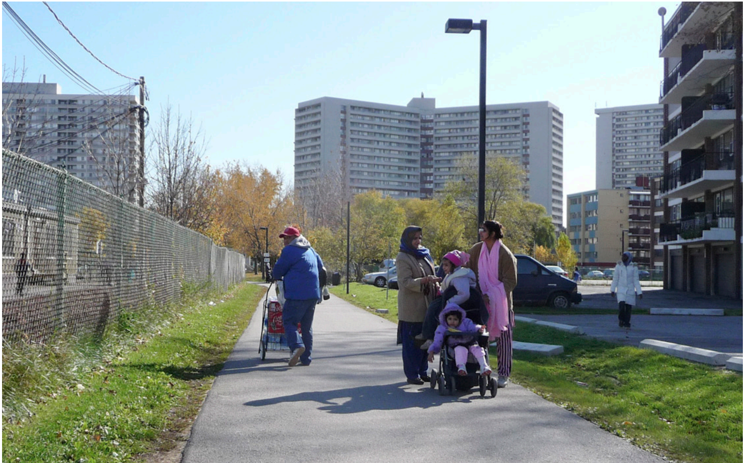
Pedestrians chat on the path from the Mall to R.V. Burgess Park