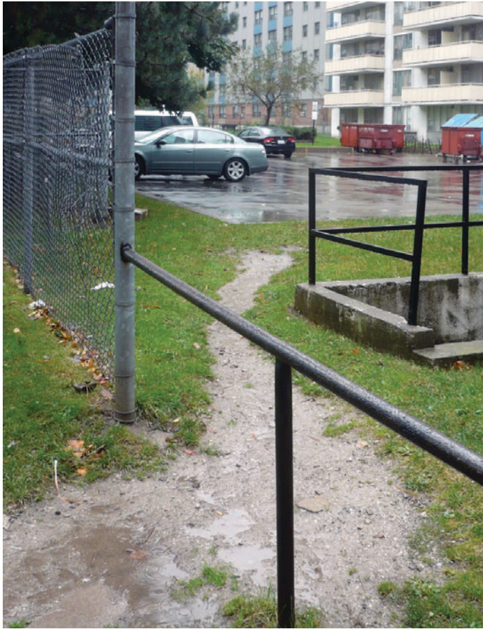
A muddy, blocked path in St James Town