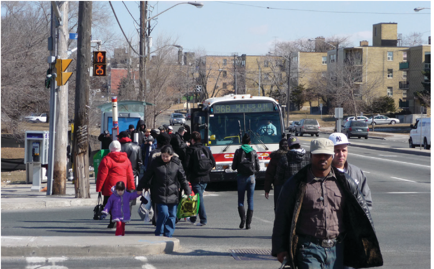
Pedestrians cross to a busy bus stop in Chalkfarm